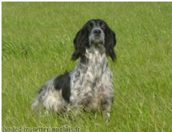
hosted by setter-anglais.fr Photo La Fougère-Aigle

2008-07-12 (F) LOF 200386/39346 Color: Noi.Mar.Fau.PBl.Env (tricolore) / Dyspl.: B Kennel