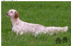
GIBELTARIK BORIS 2000-12-14 (M) GKC02014 (Ch T GQ) - liver