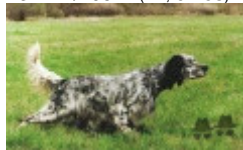
JESSY DE LA PLUME DU PÉVÈLE 1994-04-25 (F) LOF 124253/22492 - bluebelton