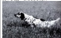
RADENTIS ERICA 1995-05-25 (F) LOI ST531494 ((CH(I)B)) - lemon