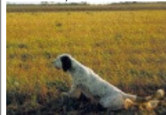
BALI DE LA DORMERIE 1986-06-22 (F) LOF 88133/13418 - lemon