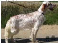
ORPHEE DU BEC ÉTOILE 1998-10-18 (F) LOF 145870/27545 (TR, CH P) - lemon