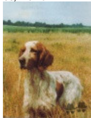
EXCEL DU BEC ÉTOILE 1989-03-22 (M) LOF 98529/13634 (Ch QFS, Trialer) - lemon