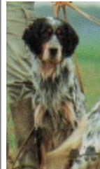
MILORD-ED DE LA PLUME DU PÉVÈLE 1996-06-10 (M) LOF 134417/20617 (TR, CH CS) - bluebelton