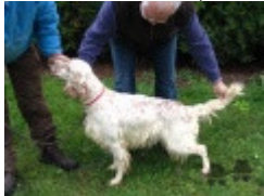
Mother CIZZLA DU BOIS DE L'HENCHY 2007-07-02 (F) LOF 192254/37599 (TR) - lemon