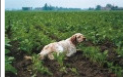
LIO DE MALAUSE 1995-05-01 (F) LOF 127925/024423 - lemon