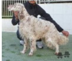
DODGE DEL TIRSO 1998-02-14 (M) LOI LO9942918 (Ch IT IT-T, CHIB, Camp. Tr. (Ch GQ)) - bluebelton