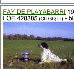
FAY DE PLAYABARRI 1990-03-06 (M) LOE 428385 (ch GQ IT) - bluebelton