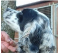
HERMO DU MAS D'EYRAUD dit HARO 1992-06-19 (M) LOF 115426/19833 (ch GQ) - bluebelton