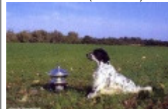
JAZZ DU RATOUNET 1994-05-19 (M) LOF 123621/19995 (TR, CH CS) - bluebelton