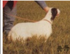
CHITA DU CLOS DES GRIVES 1987-10-14 (F) LOF 93366/15272 (Tr. GQ) - bluebelton