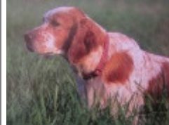
LISA DU RATOUNET 1995-09-12 (F) LOF 130186/23332 - tricolore