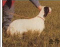
GEX DU VAL DU RUTH 1991-08-30 (M) LOF 111219/15890 (TR GQ) - lemon