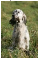
NIKITA DU POULIT SAN DANIS 1997-10-29 (F) LOF 141416/25921 - bluebelton