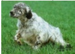
Father TAICHOU DU MILOBRE DE BOUISSE 2002-07-30 (M) LOF 166716/27209 (TR, CH A) - bluebelton