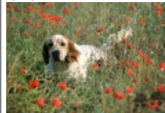
EMY DE LA CROIX GENTILHOMME 1989-03-28 (F) LOF 98990/17386 (TR) - bluebelton