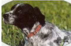
JOPLIN DE LA CROIX GENTILHOMME 1994-05-27 (F) LOF 123303/22302 - lemon