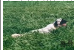
ARDENTE DU MAS D'EYRAUD 1985-06-06 (F) LOF 82818/12265 (ch GQ) - bluebelton