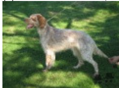
FIERO 1996-08-10 (M) LOI ST551356 (CHGQ, Ch ITF, Ch IB, Ch ITT) - lemon