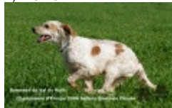
LAZZI DE MALAUSE 1995-12-15 (M) LOF 130695/20981 (TR, CH P, CH T) - lemon