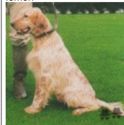
NEVA DU VAL DU RUTH 1997-11-30 (F) LOF 141374/27189 - lemon