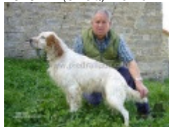
RADENTIS SBRANCO 1991-07-01 (M) LOI ST448908 (CH IB, Ch. Int. Lav.) - lemon