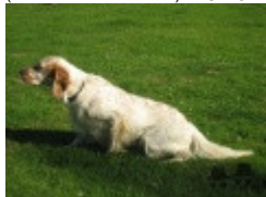
Mother ELZA DU MAS D'EYRAUD 2009-07-10 (F) LOF 205148/41059 - lemon