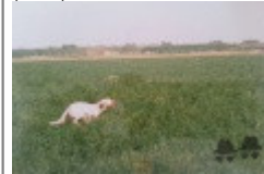
ROMANCE DU VAL DU RUTH 2000-05-10 (F) LOF 153660/28766 (Ch P) - lemon