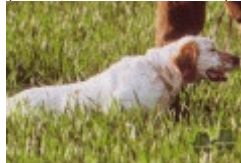
ARNO 1988-04-17 (M) LOI ST374735 (Ch. Int. Lav., Camp. Ripr., Ch. Ital. Lav.) - lemon