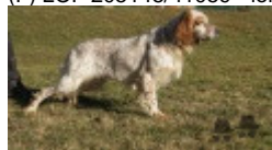
VICA DU MAS D'EYRAUD 2004-05-20 (F) LOF 176884/33678 (Tr GQ) - lemon