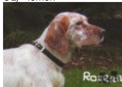
GEX DU VAL DU RUTH 1991-08-30 (M) LOF 111219/15890 (TR GQ) - lemon