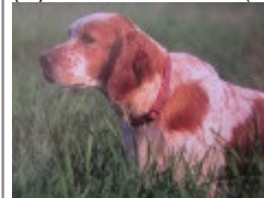
MALINE 1996-05-17 (F) LOF 133269/24239 - lemon

Breeder: LE MAS D'EYRAUD Cotation (FR): 1 Tatoo: 2GXZ077 Chip : 250269604609743 DNA deposit Italian breeding (estimated): 85% Points in pedigree: 39