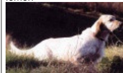
INDIRA 1990-06-01 (F) LOI ST423625 (Ch IT) - lemon