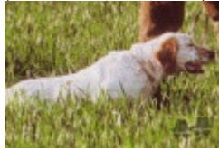
ARNO 1988-04-17 (M) LOI ST374735 (Ch. Int. Lav., Camp. Ripr., Ch. Ital. Lav.) - lemon