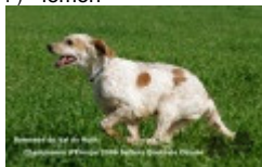
LAZZI DE MALAUSE 1995-12-15 (M) LOF 130695/20981 (TR, CH P, CH T) - lemon