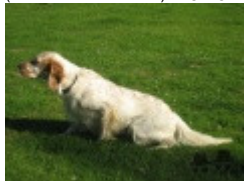
Mother DIPSY DU MAS D'EYRAUD 2008-09-16 (F) LOF 200604/41025 (TAN ,1/2 Finale CFN) - lemon