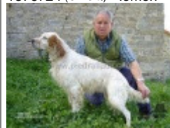
VAD DU MAS D'EYRAUD 2004-05-22 (M) LOF 176886/28894 (TR GQ) - lemon