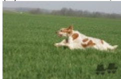
ROSENN DU MAS D'EYRAUD 2000-05-29 (F) LOF 154091/28767 (Ch GQ) - lemon