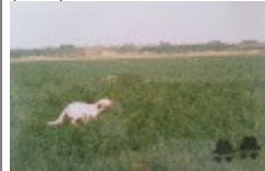
ROMANCE DU VAL DU RUTH 2000-05-10 (F) LOF 153660/28766 (Ch P) - lemon