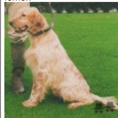
NEVA DU VAL DU RUTH 1997-11-30 (F) LOF 141374/27189 - lemon