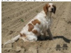
AOSTE DU MAS D'EYRAUD 2005-11-06 (F) LOF 184244/35796 (Trialer) - lemon