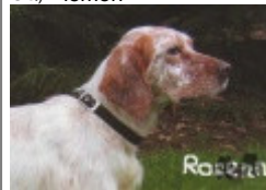
RADENTIS SBRANCO 1991-07-01 (M) LOI ST448908 (CH IB, Ch. Int. Lav.) - lemon