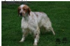
RITA DU MAS D'EYRAUD 2000-09-29 (F) LOF 154090/29079 - lemon