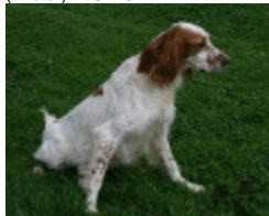
FIERO 1996-08-10 (M) LOI ST551356 (CHGQ, Ch ITF, Ch IB, Ch ITT) - lemon