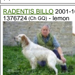
RADENTIS BILLO 2001-10-25 (M) LOE 1376724 (Ch GQ) - lemon