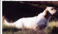
INDIRA 1990-06-01 (F) LOI ST423625 (Ch IT) - lemon