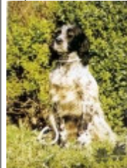
FRENK DI SAN PELLEGRINO 1989-05-13 (M) LOI ST402410 (Ch P IT) - lemon