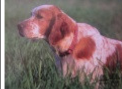
LISA DU RATOUNET 1995-09-12 (F) LOF 130186/23332 - tricolore