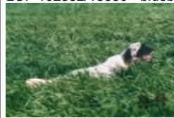
ARDENTE DU MAS D'EYRAUD 1985-06-06 (F) LOF 82818/12265 (ch GQ) - bluebelton