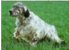
Mother UZZEA DU MILOBRE DE BOUISSE 2003-05-07 (F) LOF 170061/34289 (TAN) - bluebelton