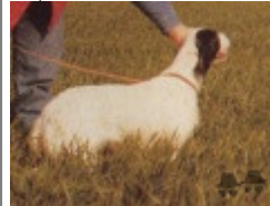
GEX DU VAL DU RUTH 1991-08-30 (M) LOF 111219/15890 (TR GQ) - lemon