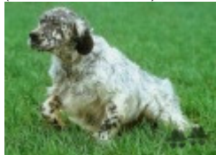
Father TAICHOU DU MILOBRE DE BOUISSE 2002-07-30 (M) LOF 166716/27209 (TR, CH A) - bluebelton