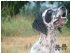
HERMO DU MAS D'EYRAUD dit HARO 1992-06-19 (M) LOF 115426/19833 (ch GQ) - bluebelton