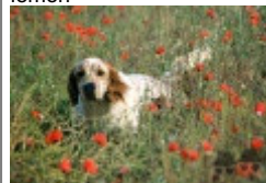
EMY DE LA CROIX GENTILHOMME 1989-03-28 (F) LOF 98990/17386 (TR) - bluebelton