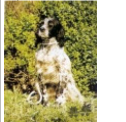
FRENK DI SAN PELLEGRINO 1989-05-13 (M) LOI ST402410 (Ch P IT) - lemon