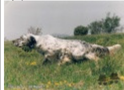
DEFESSE DU VAL D'ARZ 1988-06-08 (F) LOF 95715/15373 (Ch P TR CS) - lemon