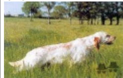
DERBY DES SEPT PROVINCES 1988-08-14 (M) LOF 97390/14137 (CH CS.CH A,CH P, CH T,CH IT) - bluebelton