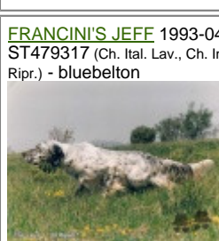
FRANCINI'S JEFF 1993-04-03 (M) LOI ST479317 (Ch. Ital. Lav., Ch. Int. Lav., Camp. Ripr.) - bluebelton