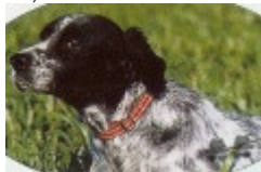
JOPLIN DE LA CROIX GENTILHOMME 1994-05-27 (F) LOF 123303/22302 - lemon