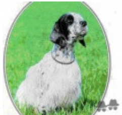
CHITA DU CLOS DES GRIVES 1987-10-14 (F) LOF 93366/15272 (Tr. GQ) - bluebelton