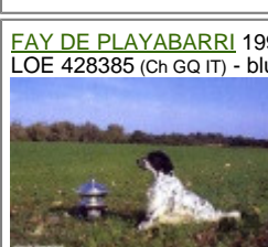
FAY DE PLAYABARRI 1990-03-06 (M) LOE 428385 (ch GQ IT) - bluebelton