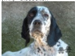
RASTA DE LA PLUME DU PÉVÈLE 2000-06-08 (F) LOF 154692/28872 (TR) - bluebelton