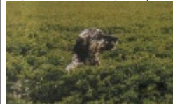
EPICE DU PLAT D'ALCY 1989-05-20 (F) LOF 99047/16711 - tricolore