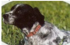
JOPLIN DE LA CROIX GENTILHOMME 1994-05-27 (F) LOF 123303/22302 - lemon