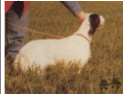
CHITA DU CLOS DES GRIVES 1987-10-14 (F) LOF 93366/15272 (Tr. GQ) - bluebelton