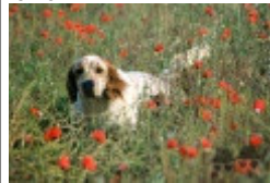
EMY DE LA CROIX GENTILHOMME 1989-03-28 (F) LOF 98990/17386 (TR) - bluebelton