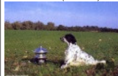
JAZZ DU RATOUNET 1994-05-19 (M) LOF 123621/19995 (TR, CH CS) - bluebelton