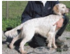
RADENTIS SBRANCO 1991-07-01 (M) LOI ST448908 (CH IB, Ch. Int. Lav.) - lemon