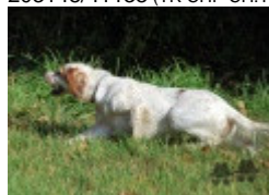
MAGIC DE KERFEUIL 1996-07-11 (M) LOF 134276/21281 (TR, CH P, CH T) - bluebelton