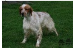
RITA DU MAS D'EYRAUD 2000-09-29 (F) LOF 154090/29079 - lemon