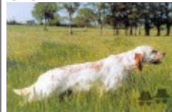
COOL DE CODORNIS 1987-08-02 (M) LOF 92622/12503 (CH IT, CH GQ) - bluebelton