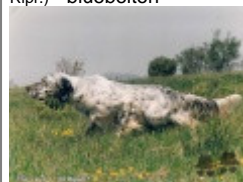
DEFESSE DU VAL D'ARZ 1988-06-08 (F) LOF 95715/15373 (Ch P TR CS) - lemon