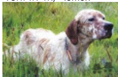
VOLF DE CAZAQUS 2004-05-01 (M) LOF 176024/28582 (CH.T. -CHP -CHA -VOF/FTA -TR) - lemon