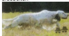
FRANCINI'S JEFF 1993-04-03 (M) LOI ST479317 (Ch. Ital. Lav., Ch. Int. Lav., Camp. Ripr.) - bluebelton