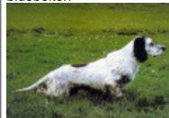
LORADA DE L'ECHO DE LA FORET 1995-05-14 (F) LOF 127517/22592 (TR, CH A, CH P) - tricolore