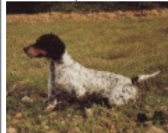
PANGO DU MAS D'EYRAUD 1999-06-15 (M) LOF 148377/24028 (TR CHA CHP CH.T. VOF/FTA) - lemon