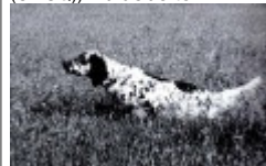
RADENTIS ERICA 1995-05-25 (F) LOI ST531494 ((CH(I)B)) - lemon