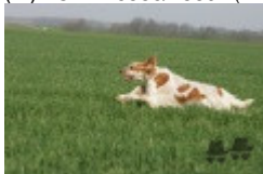
RADENTIS BILLO 2001-10-25 (M) LOE 1376724 (Ch GQ) - lemon