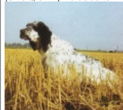
ODE DEL SOLE 1993-09-10 (F) LOI ST490145 - liver