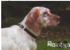
MALINE 1996-05-17 (F) LOF 133269/24239 - lemon