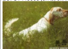
RADENTIS ALA 1994-03-15 (F) LOI ST496649 (Ch T) - lemon