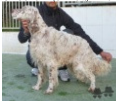
DODGE DEL TIRSO 1998-02-14 (M) LOI LO9942918 (Ch IT IT-T, CHIB, Camp. Tr. Ch GQ) - bluebelton