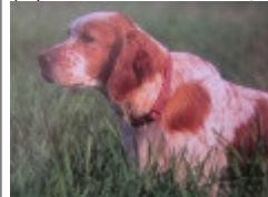
ROSENN DU MAS D'EYRAUD 2000-05-29 (F) LOF 154091/28767 (Ch GQ) - lemon