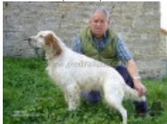
RADENTIS SBRANCO 1991-07-01 (M) LOI ST448908 (CH IB, Ch. Int. Lav.) - lemon