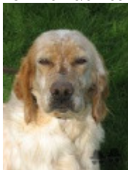
GIBELTARIK BORIS 2000-12-14 (M) GKC02014 (Ch T GQ) - liver