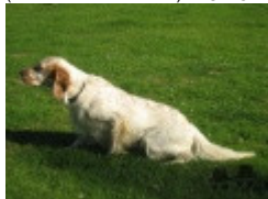
USSAN DU MAS D'EYRAUD 2003-10-21 (M) LOF 173466/28517 (CHGQ TRGQ CHITF) - lemon