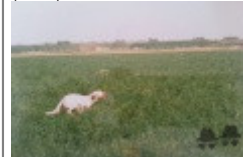
LAZZI DE MALAUSE 1995-12-15 (M) LOF 130695/20981 (TR, CH P, CH T) - lemon