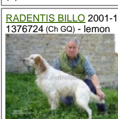
RADENTIS BILLO 2001-10-25 (M) LOE 1376724 (Ch GQ) - lemon