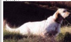
INDIRA 1990-06-01 (F) LOI ST423625 (Ch IT) - lemon