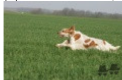
RADENTIS ODESSA 2003-02-18 (F) LOF 175115/32206 - lemon