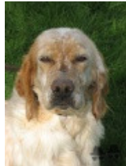
ARNO 1988-04-17 (M) LOI ST374735 (Ch. Int. Lav., Camp. Ripr., Ch. Ital. Lav.) - lemon