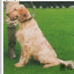
NEVA DU VAL DU RUTH 1997-11-30 (F) LOF 141374/27189 - lemon