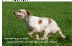
VAD DU MAS D'EYRAUD 2004-05-22 (M) LOF 176886/28894 (TR GQ) - lemon