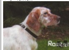
GIBELTARIK BORIS 2000-12-14 (M) GKC02014 (Ch T GQ) - liver