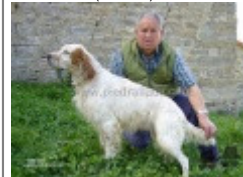
ROSENN DU MAS D'EYRAUD 2000-05-29 (F) LOF 154091/28767 (Ch GQ) - lemon