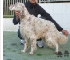
ARIET ALESS SETTER 2000-02-15 (F) LOI LO0058153 - bluebelton