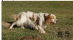
FIERO 1996-08-10 (M) LOI ST551356 (CHGQ, Ch ITF, Ch IB, Ch ITT) - lemon