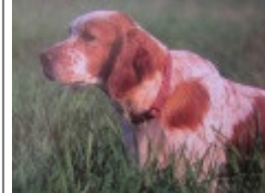
MALINE 1996-05-17 (F) LOF 133269/24239 - lemon