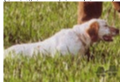
ARNO 1988-04-17 (M) LOI ST374735 (Ch. Int. Lav., Camp. Ripr., Ch. Ital. Lav.) - lemon