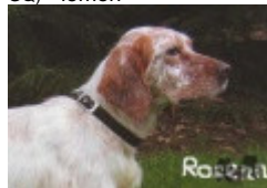
GEX DU VAL DU RUTH 1991-08-30 (M) LOF 111219/15890 (TR GQ) - lemon