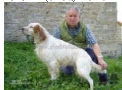
RADENTIS SBRANCO 1991-07-01 (M) LOI ST448908 (CH IB, Ch. Int. Lav.) - lemon