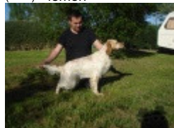
VICA DU MAS D'EYRAUD 2004-05-20 (F) LOF 176884/33678 (Tr GQ) - lemon