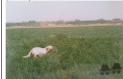
ROMANCE DU VAL DU RUTH 2000-05-10 (F) LOF 153660/28766 (Ch P) - lemon