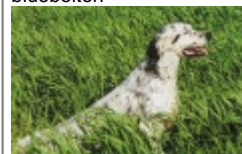
LIZA DU SENTIER DES LUTINS 1995-07-19 (F) LOF 128401/22824 (CH P) - tricolore