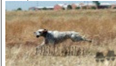
LYSA DU BEC ÉTOILE 1995-05-06 (F) LOF 127341/23640 (CH A, CH P, CH T) - lemon