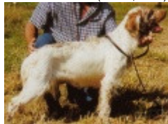
SOUKY DES FORÊTS CORRÉZIENNES 2001-08-27 (M) LOF 163749/26526 (TR GQ, CH P) - bluebelton