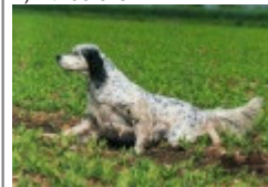
CICO DELL'ABAZIA 1993-07-28 (M) LOI ST492509 (Ch. Ital. Lav.) - lemon