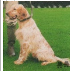
NEVA DU VAL DU RUTH 1997-11-30 (F) LOF 141374/27189 - lemon