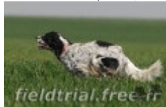
UKRAINE DES FORÊTS CORRÉZIENNES 2003-03-10 (F) LOF 171034/33875 (TAN) - liver