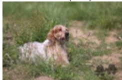
Mother FIDJIE DES FORÊTS CORRÉZIENNES 2010-02-22 (F) LOF 208952/41329 (TAN, TAC) - lemon