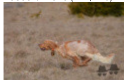
ANETH DES FORÊTS CORRÉZIENNES 2005-07-30 (F) LOF 184210/36285 - bluebelton