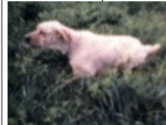
LARA 1995-03-01 (F) LOI ST518663 - liver