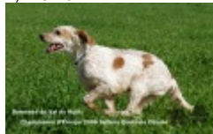
VAD DU MAS D'EYRAUD 2004-05-22 (M) LOF 176886/28894 (TR GQ) - lemon