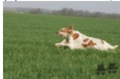
UVÉE DU BEC ÉTOILE 2003-06-29 (F) LOF 171625/32501 (TR) - lemon