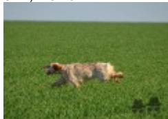
FIERO 1996-08-10 (M) LOI ST551356 (CHGQ, Ch ITF, Ch IB, Ch ITT) - lemon