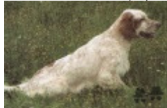
ARNO 1988-04-17 (M) LOI ST374735 (Ch. Int. Lav., Camp. Ripr., Ch. Ital. Lav.) - lemon