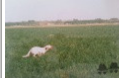
LAZZI DE MALAUSE 1995-12-15 (M) LOF 130695/20981 (TR, CH P, CH T) - lemon