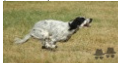
OFIRA 1998-01-08 (F) LOF 148825/26602 (Trialer, Ch P) - lemon