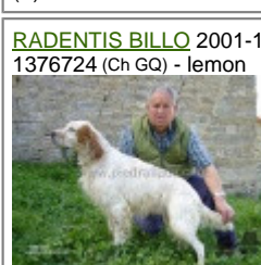
RADENTIS BILLO 2001-10-25 (M) LOE 1376724 (Ch GQ) - lemon