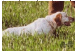
ROMANCE DU VAL DU RUTH 2000-05-10 (F) LOF 153660/28766 (Ch P) - lemon