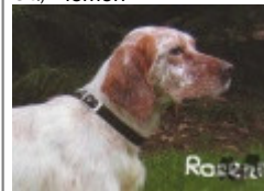
LIDER DE PLAYABARRI dit LEADER 1996-11-01 (M) LOE 856545 (Ch A, Ch IT, Tr GQ) - lemon