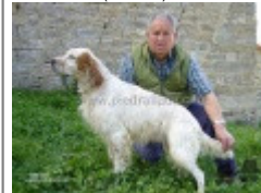
ROSENN DU MAS D'EYRAUD 2000-05-29 (F) LOF 154091/28767 (Ch GQ) - lemon