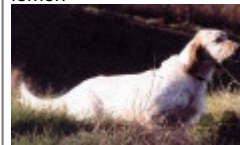
INDIRA 1990-06-01 (F) LOI ST423625 (Ch IT) - lemon