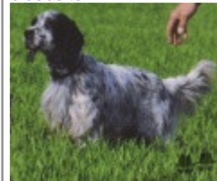
PISTACHE DES FORÊTS CORRÉZIENNES 1999-08-30 (F) LOF 152539/28912 - bluebelton