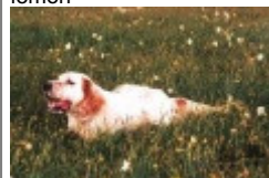
GEIN 2001-07-15 (F) LOI LO01193269 - tricolore