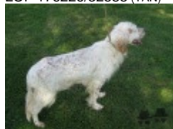
RADENTIS COBRA 2000-06-30 (M) LOI LO0128791 (Camp. Tr. (Ch GQ)) - lemon