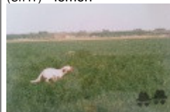
ROMANCE DU VAL DU RUTH 2000-05-10 (F) LOF 153660/28766 (Ch P) - lemon