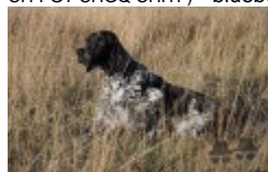
CALLIA DU MAS D'EYRAUD 2007-04-16 (F) LOF 191553/38395 - bluebelton