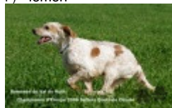
LAZZI DE MALAUSE 1995-12-15 (M) LOF 130695/20981 (TR, CH P, CH T) - lemon