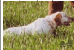
JOCYA DU MAS D'EYRAUD 1994-01-07 (F) LOF 121263/23625 (CHP -TR) - bluebelton