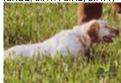
ARNO 1988-04-17 (M) LOI ST374735 (Ch. Int. Lav., Camp. Ripr., Ch. Ital. Lav.) - lemon