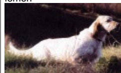
INDIRA 1990-06-01 (F) LOI ST423625 (Ch IT) - lemon