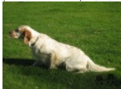
Father FILOU DU MAS D'EYRAUD 2010-05-29 (M) LOF 209931/37009 (TR CH-FGT CHGQ CHITF) - bluebelton