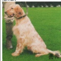
NEVA DU VAL DU RUTH 1997-11-30 (F) LOF 141374/27189 - lemon