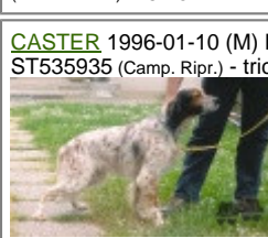
CASTER 1996-01-10 (M) LOI ST535935 (Camp. Ripr.) - tricolore