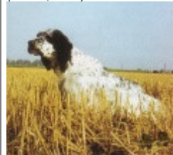
ZIVKA 2000-04-30 (F) LOI LO03129930 (Ch. Ital. Lav.) - lemon