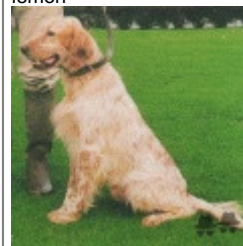
NEVA DU VAL DU RUTH 1997-11-30 (F) LOF 141374/27189 - lemon