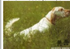
RADENTIS ERICA 1995-05-25 (F) LOI ST531494 ((CH(IB)) - lemon