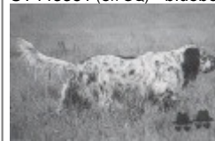
ASTRA DEL TIRSO 1992-10-01 (F) LOI ST454300 - lemon