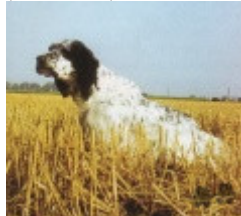
PICENUM UNGA 1990-10-02 (F) LOI ST430406 (CH GQ) - liver