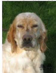
ARIET ALESS SETTER 2000-02-15 (F) LOI LO0058153 - bluebelton