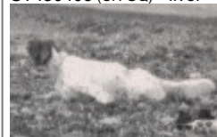
ODE DEL SOLE 1993-09-10 (F) LOI ST490145 - liver