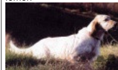
LERRY 1997-02-14 (M) LOI ST555862 (Ch GQ, Ch IT) - bluebelton