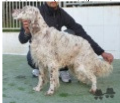
GIBELTARIK BORIS 2000-12-14 (M) GKC02014 (Ch T GQ) - liver