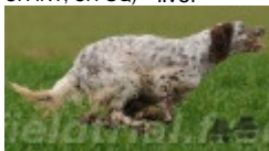
NOTADO DELLA VECCHIA IRLANDA 2006-01-05 (M) LOI LO0664539 (CH IT, CH INT, CH GQ) - liver

Mother POLA DE LA SOLARIEGA 2014-11-18 (F) LOE 2221158 - bluebelton