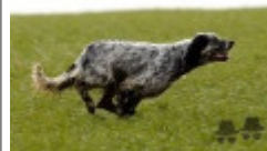
ASIA 2003-07-08 (F) LOI LO03125315 - bluebelton