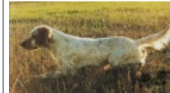
DORISS DE L'ECHO DE LA FORET 1988-08-25 (F) LOF 96924/15609 (CH P, Tr GQ) - tricolore