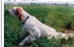
SWING DELLA VECCHIA IRLANDA 1984-08-01 (F) LOI ST295020 (Ch L) - lemon