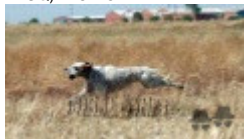
Mother SAIDA DE L'ECHO DE LA FORET 2001-07-01 (F) LOF 160674/30214 (CH A, CH CS) - lemon