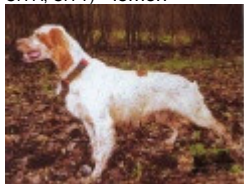
PALU' 1993-09-04 (M) LOE 662202 (Tr GQ) - lemon