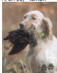
NADE DE L'ECHO DE LANVAUX 1997-04-14 (F) LOF 138295/26034 (TR, CH A, CH T) - lemon