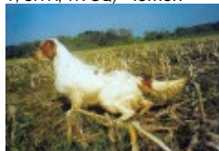
GRACKEL 1991-05-01 (F) LOF 109008/18375 (TR, CH P, CH T) - tricolore