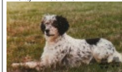
ALMER 1984-04-03 (M) LOF 81739/9431 (CHQFS CHQFC CHCPC TR) - bluebelton