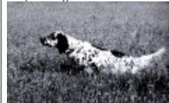
RADENTIS ERICA 1995-05-25 (F) LOI ST531494 ((CH(I)B)) - lemon