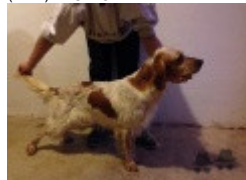
RADENTIS ODESSA 2003-02-18 (F) LOF 175115/32206 - lemon