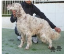
ARIET ALESS SETTER 2000-02-15 (F) LOI LO0058153 - bluebelton