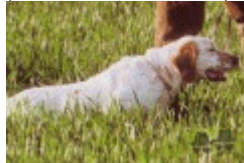
ROMANCE DU VAL DU RUTH 2000-05-10 (F) LOF 153660/28766 (Ch P) - lemon