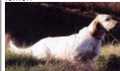
INDIRA 1990-06-01 (F) LOI ST423625 (Ch IT) - lemon