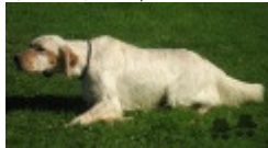
Mother FAUSTINE DU MAS D'EYRAUD 2010-06-05 (F) LOF 210135/41817 (TAN) - lemon