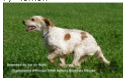
GIBELTARIK BORIS 2000-12-14 (M) GKC02014 (Ch T GQ) - liver