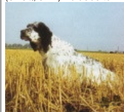
ODE DEL SOLE 1993-09-10 (F) LOI ST490145 - liver