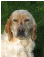
FIERO 1996-08-10 (M) LOI ST551356 (CHGQ, Ch ITF, Ch IB, Ch ITT) - lemon