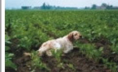
LERRY 1997-02-14 (M) LOI ST555862 (Ch GQ, Ch IT) - bluebelton