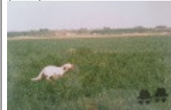
LAZZI DE MALAUSE 1995-12-15 (M) LOF 130695/20981 (TR, CH P, CH T) - lemon