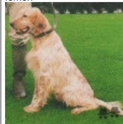
NEVA DU VAL DU RUTH 1997-11-30 (F) LOF 141374/27189 - lemon