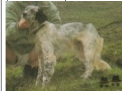
POLY DES SEPT PROVINCES 2001-08-08 (F) LOF 150830/28240 - bluebelton