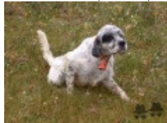
MAGIC DE KERFEUIL 1996-07-11 (M) LOF 134276/21281 (TR, CH P, CH T) - bluebelton