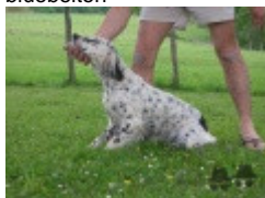
RADENTIS SBRANCO 1991-07-01 (M) LOI ST448908 (CH IB, Ch. Int. Lav.) - lemon