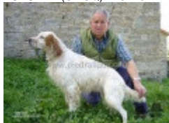
Mother ESPELETTE DES SEPT PROVINCES 2009-06-18 (F) LOF 206861/40843 - lemon