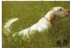
RADENTIS BORG 1987-04-30 (M) LOI ST350267 (Ch. Int. Lav., CH GQ, Ch. Ital. Lav., Camp. Ripr.) - lemon