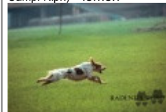
RADENTIS OLA 1984-09-30 (F) LOI ST298174 - lemon