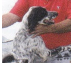
N'DOKY DES SEPT PROVINCES 1997-05-14 (M) LOF 138784/22001 (CHITF CHP TR) - bluebelton