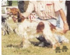
ORFEO DELLA TRAPPOLA 1973-10-11 (M) LOI ST067273 (Ch Italie, T GQ) - tricolore