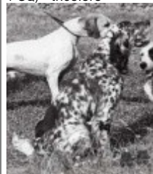
BISCIA DEL SOLE 1980-03-08 (F) LOI ST212543 (Ch T) - bluebelton