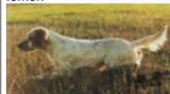
HYPER DE L'ECHO DE LA FORET 1992-01-01 (M) LOF 111469/16750 (CH T, CH A, TR GQ) - lemon