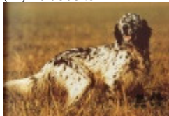
DEESSE DU VAL CLAIR 1988-05-01 (F) LOF 95020/15653 (TR) - liver