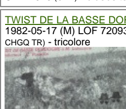
TWIST DE LA BASSE DORDOGNE 1982-05-17 (M) LOF 72093/8334 (CHCS CHGQ TR) - tricolore