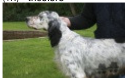
NADE DE L'ECHO DE LANVAUX 1997-04-14 (F) LOF 138295/26034 (TR, CH A, CH T) - lemon