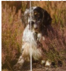
ALMER 1984-04-03 (M) LOF 81739/9431 (CHQFS CHQFC CHCPC TR) - bluebelton