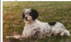
GRACKEL 1991-05-01 (F) LOF 109008/18375 (TR, CH P, CH T) - tricolore