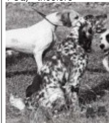
BISCIA DEL SOLE 1980-03-08 (F) LOI ST212543 (Ch T) - bluebelton