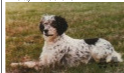
ALMER 1984-04-03 (M) LOF 81739/9431 (CHQFS CHQFC CHCPC TR) - bluebelton