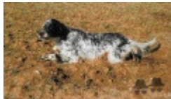
IVAN DU VAL CLAIR 1993-05-30 (M) LOF 119869/17477 (TR, CH P, CH T) - tricolore