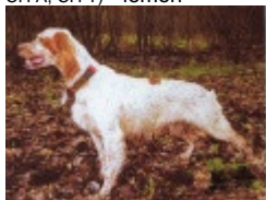
BOI 1984-02-20 (M) LOF 96481/12378 (TR) - bluebelton