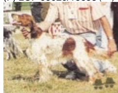
HYPER DE L'ECHO DE LA FORET 1992-01-01 (M) LOF 111469/16750 (CH T, CH A, TR GQ) - lemon