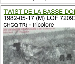
TWIST DE LA BASSE DORDOGNE 1982-05-17 (M) LOF 72093/8334 (CHCS CHGQ TR) - tricolore