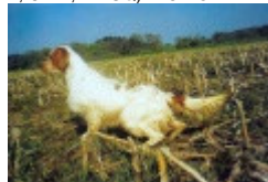
GRACKEL 1991-05-01 (F) LOF 109008/18375 (TR, CH P, CH T) - tricolore