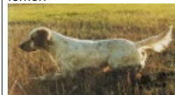
DORISS DE L'ECHO DE LA FORET 1988-08-25 (F) LOF 96924/15609 (CH P, Tr GQ) - tricolore