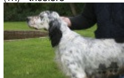
NADE DE L'ECHO DE LANVAUX 1997-04-14 (F) LOF 138295/26034 (TR, CH A, CH T) - lemon