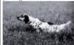
PRYZIA DES RIVES DU BEL-AIR 1999-09-19 (F) LOF 151198/28948 (TR, CHP) - lemon