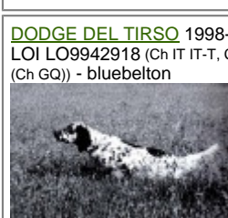
DODGE DEL TIRSO 1998-02-14 (M) LOI LO9942918 (Ch IT-T, CHIB, Camp. Tr. (Ch GQ)) - bluebelton