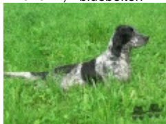
UTOPIE DE MALAUSE 2003-06-01 (F) LOF 172316/33052 - lemon