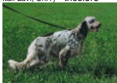
UZES DES BORDS DE LA VAREZE 2003-05-27 (F) LOF 171343/32906 (TR GQ) - lemon