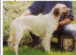
TOY DU SENTIER DES LUTINS 2002-09-29 (M) LOF 167778/27198 (TR) - lemon