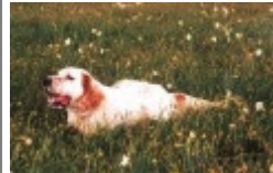
MARDI DE MALAUSE 1996-11-30 (F) LOF 136011/25226 - lemon