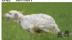
VERDI DU BIEF JOLI 2004-03-14 (M) LOF 174726/28629 (CH.T. -CHTGS -TRCHCH.T) - bluebelton