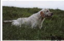
SAIDA DE MALAUSE 2001-01-01 (F) LOF 157494/29418 (CHITF -CHTGS -CHP -CHA -TR) - bluebelton