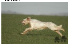
UNES DE L'ECHO DE LA FORET 2003-06-01 (F) LOF 170799/33817 (TR) - tricolore