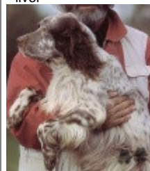
TRUEBA DI LORO PICENO 1999-09-25 (F) LOI LO0049020 - BIANCO MASCHERA ASIMMETRICA SX E