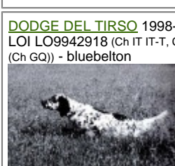
DODGE DEL TIRSO 1998-02-14 (M) LOI LO9942918 (Ch IT IT-T, CHIB, Camp. Tr. (Ch GQ)) - bluebelton