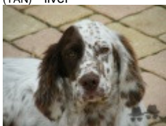
BOBET DI LORO PICENO 2003-08-10 (M) LOI LO041853 (Camp. Tr. (Ch GQ), Ch Ital. Lav., ChIT) - tricolore