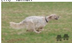
DIAMS DU VALLAT DE GALANCE 2008-06-13 (F) LOF 199136/38735 (TAN) - liver