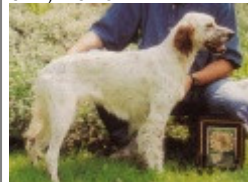
ZIBEL 1997-05-23 (M) LOI LO9814304 (Ch IT Ch IT B) - liver