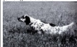
PRYZIA DES RIVES DU BEL-AIR 1999-09-19 (F) LOF 151198/28948 (TR, CHP) - lemon