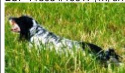
OURAL DE L'ECHO DE LA FORET 1998-03-02 (M) LOF 141973/23012 (CHA -TR) - tricolore