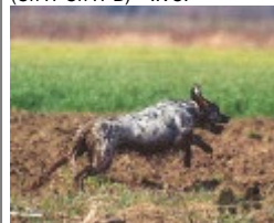
HAPPY DE LA MUNIA 1992-06-28 (F) LOF 115034/19917 (TR, CH T) - tricolore