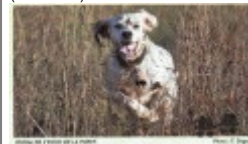
MIDINE DES BOIS GEMMES 1996-02-07 (F) LOF 131323/24625 (CHP -TR) - lemon