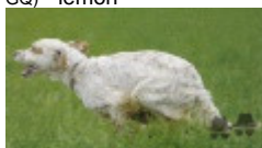
RAUL DE LA MUNIA 2000-08-15 (M) LOF 157086/25614 (TR, CH A, CH P, CH T) - lemon