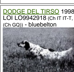
DODGE DEL TIRSO 1998-02-14 (M) LOI LO9942918 (Ch IT-T, CHIB, Camp. Tr. (Ch GQ)) - bluebelton