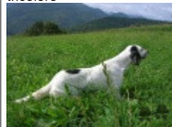
HECTORE DEL ZAGNIS 2006-12-21 (M) LOI LO0818749 (Ch. Ital. Lav., CH GQ) - bluebelton