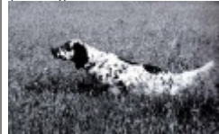
UZES DES BORDS DE LA VAREZE 2003-05-27 (F) LOF 171343/32906 (TR GQ) - lemon