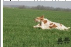
RADENTIS GLORY 2003-05-22 (F) LOF 176227/32584 - bluebelton