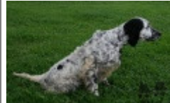
BOY DES COLLINES DE L'IZARS 2006-03-23 (M) LOF 186771/30733 (TR, CH T, CH GQ) - tricolore