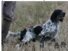
VAD DU MAS D'EYRAUD 2004-05-22 (M) LOF 176886/28894 (TR GQ) - lemon