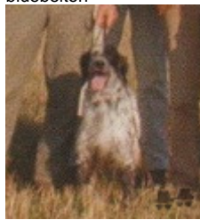
NERO 1997-03-29 (M) LOI LO9817889 (Ch T, Ch GQ) - bluebelton