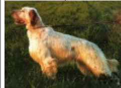
NIRTIE DE L'ECHO DE LA FORET 1997-06-23 (F) LOF 138882/25781 (Ch P A) - tricolore