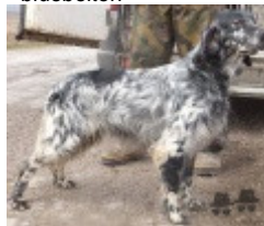
KAPO 2003-11-10 (M) LOI LO0439835 (Ch IT GQ) - bluebelton