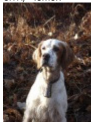
RADENTIS D'ESPANA 1995-05-22 (M) LOE 990823 (Ch IT B, Ch GQ) - lemon