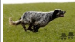
KEDI 2003-08-10 (F) LOI LO0411752 - bluebelton