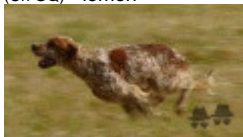
MARTIANISIUM LUTER 2001-05-05 (M) LOI LO01138037 (CH GQ (Camp. Tr.)) - bluebelton