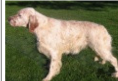
FIERO 1996-08-10 (M) LOI ST551356 (CHGQ, Ch ITF, Ch IB, Ch ITT) - lemon