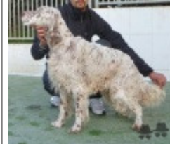
ARIET ALESS SETTER 2000-02-15 (F) LOI LO0058153 - bluebelton