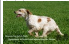
RADENTIS BILLO 2001-10-25 (M) LOE 1376724 (Ch GQ) - lemon