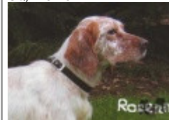
GIBELTARIK BORIS 2000-12-14 (M) GKC02014 (Ch T GQ) - liver