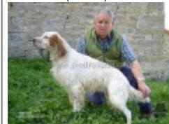
ROSENN DU MAS D'EYRAUD 2000-05-29 (F) LOF 154091/28767 (Ch GQ) - lemon