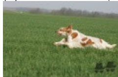
RADENTIS ODESSA 2003-02-18 (F) LOF 175115/32206 - lemon