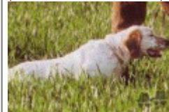
ROMANCE DU VAL DU RUTH 2000-05-10 (F) LOF 153660/28766 (Ch P) - lemon