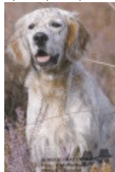
UM'LYN DU MAS D'EYRAUD 2003-10-21 (F) LOF 173469/32848 - lemon