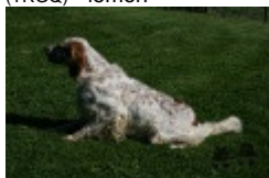
CAFOU DU MAS D'EYRAUD 2007-05-29 (M) LOF 192943/32631 (TRGQ) - lemon

Mother FROG DU MAS D'EYRAUD 2010-08-20 (F) LOF 212653/46550 (TAN , TRIALER P) - lemon