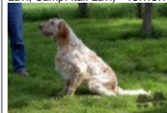
RADENTIS ODE 2003-02-18 (F) LOF 175116/32207 - lemon