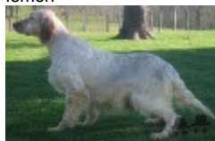
VAD DU MAS D'EYRAUD 2004-05-22 (M) LOF 176886/28894 (TR GQ) - lemon