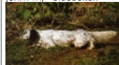
ISOLE DE L'OREE DU BOIS BECASSES 1993-10-29 (F) LOF 121249/21582 - tricolore