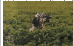
GRETA DE L'ETOILE DE MOREUIL 1991-05-02 (F) LOF 107998/20272 - bluebelton