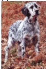
NIL DE LA PLUME DU PÉVÈLE 1997-04-08 (M) LOF 137243/22656 (Ch GQ, Ch IT, Ch IB, CH(GB)B) - bluebelton