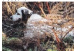
ISARD DES RIVES DU HAOU 1993-01-03 (M) LOF 116789/17126 (CH.T. TR) - bluebelton