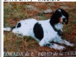
MISÈRE DE CODORNIS 1996-08-26 (F) LOF 134615/25431 (Ch A) - bluebelton