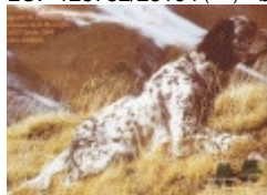
DERBY DES SEPT PROVINCES 1988-08-14 (M) LOF 97390/14137 (CH CS, CH A, CH P, CH T, CH IT) - bluebelton