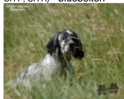
ULA DE LA MALETIERE 2003-03-18 (F) LOF 170256/33940 (TR) - tricolore