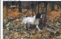
POULBOT DE CAZAQUS 1999-09-20 (M) LOF 151060/24266 (TR, CH A) - tricolore