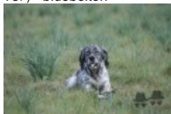
Mother CABANA DE LA MALETIERE 2007-07-14 (F) LOF 193581/38739 (TR, CH P, CH A) - bluebelton