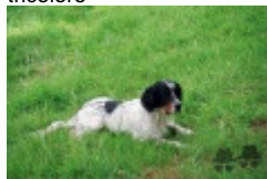
LORADA DE L'ECHO DE LA FORET 1995-05-14 (F) LOF 127517/22592 (TR, CH A, CH P) - tricolore