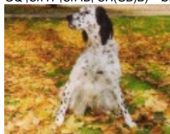
LIO DU VAL D'AUTAN 1995-06-19 (F) LOF 128782/23194 (TR) - bluebelton