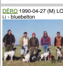
DÉRO 1990-04-27 (M) LOI 423463 (Ch L) - bluebelton