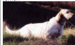
INDIRA 1990-06-01 (F) LOI ST423625 (Ch IT) - lemon