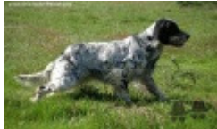
MAIA 1985-01-02 (F) LOI ST302360 - tricolore