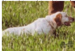
ARNO 1988-04-17 (M) LOI ST374735 (Ch. Int. Lav., Camp. Ripr., Ch. Ital. Lav.) - lemon