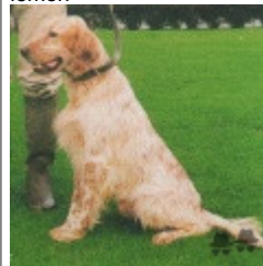
NEVA DU VAL DU RUTH 1997-11-30 (F) LOF 141374/27189 - lemon