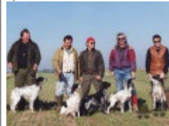
BRINA 1994-06-10 (F) LOI ST499536 - bluebelton