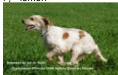
LAZZI DE MALAUSE 1995-12-15 (M) LOF 130695/20981 (TR, CH P, CH T) - lemon