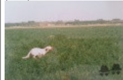
ROMANCE DU VAL DU RUTH 2000-05-10 (F) LOF 153660/28766 (Ch P) - lemon