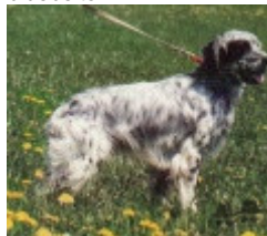
LORD DEL DIANELLA 1981-04-05 (M) LOI ST234361 (Ch. Ital. Lav.) - bluebelton